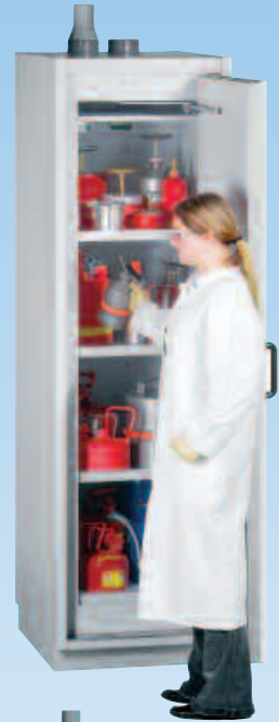
Model No 22500 Depth with the doors open: 1090 mm.

Total height including base (84.5 mm) and extractor connection (40 mm) is 1995 mm.