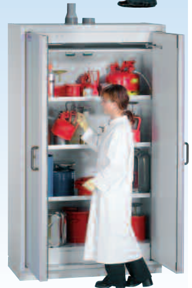
Model No 22510 Depth with the doors open: 1130 mm.

Each cabinet includes 3 shelves, 1 bottom tray and 1 tray insert, and packaging