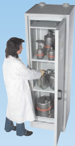
Model No 22520 Depth with the doors open: 1105 mm.

Total height including ventilation connection is 1985 mm.