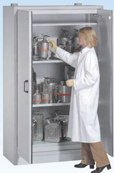
Model No 22530 Depth with the doors open: 1150 mm.

Total height including ventilation connection is 1985 mm.